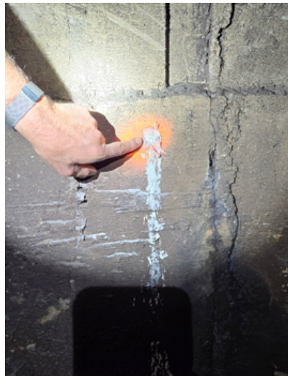
Close up of grout return