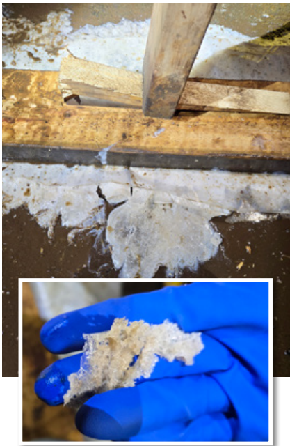
Close up of floor foam