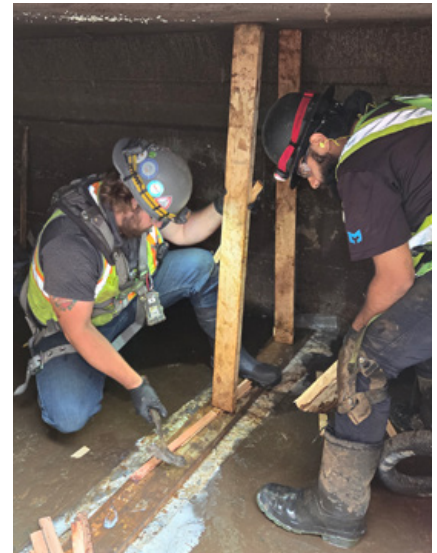
Strutting placed on floor joint after application of resin and oakum

concrete and to allow a better bond for the next step. The chipped concrete and excess water was removed by creating a mini dam on either side of the floor joint, and using a shopvac with a floor pump to remove all the debris and most of the water. The joint did not need to be bone dry as the final step does require some moisture for everything to set together.