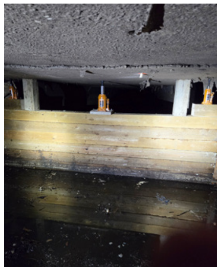
Dam at end of project