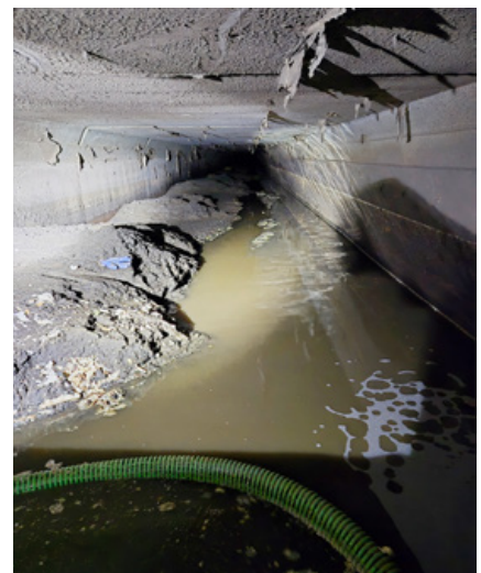
Sediment in culvert beyond the dam