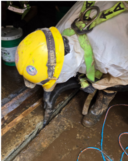
Floor joint cleaned out then stuffed with oakum