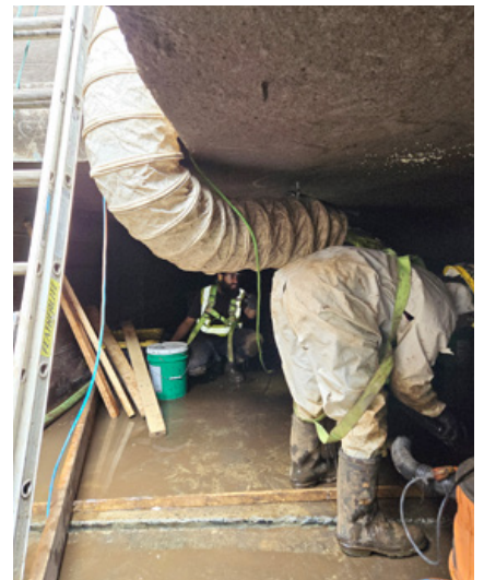
Typical Working Conditions

While these holes were being injected the PW crews were busy removing the upper 4 inches of lumber in the floor joints. The floor joint lumber might have been 2X6's or 2x8's or 2x10's but only 4 inches had to be removed. Once done the edges of the floor joints were chipped to remove any loose