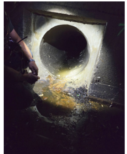
One of many service pipes into the box culvert

section of culvert along No. 4 road, from Alderbridge Way to Westminster Highway. The contract included an optional item to extend the work from Alderbridge Way to Granville Avenue, which was awarded and is underway in 2025. In the earlier phases of this maintenance work, culverts were rehabilitated using sliplining techniques with Glass Reinforced Pipe (GRP), and traditional open cut methods were used on the earliest phase.